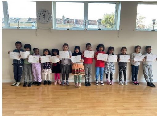
Class 11 Winners

Well done to all the children who took part, and congratulations to all the children whose poem has been chosen for publishing! These children have all received a certificate for their achievement, and will have their poem published in the book 'This Is Me! Acrostics - Little Poets' in the New Year.